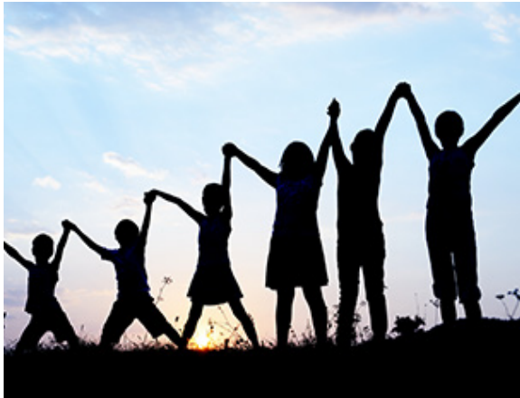
“Strategic Relationeering” Solutions